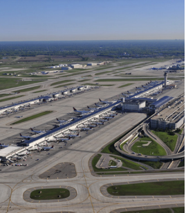
Wayne County Airport Authority

Detroit Metropolitan Airport (DTW) is one of the worlds’ largest air transportation hubs with more than 1,100 flights per day to and from four continents. DTW is operated by the Wayne County Airport Authority (WCAA), which also operates nearby Willow Run Airport (YIP), an important corporate, cargo, and general aviation facility. WCAA drives economic activity. Its airports are not only responsible for creating jobs, but also sustaining more than 86,000 jobs throughout the state.